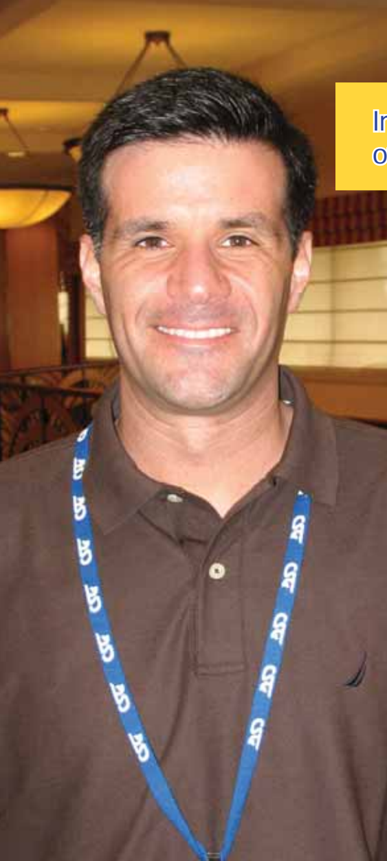
Sen. Kevin Coughlin of Ohio attended CSG's conference on preparing for pandemic outbreaks.