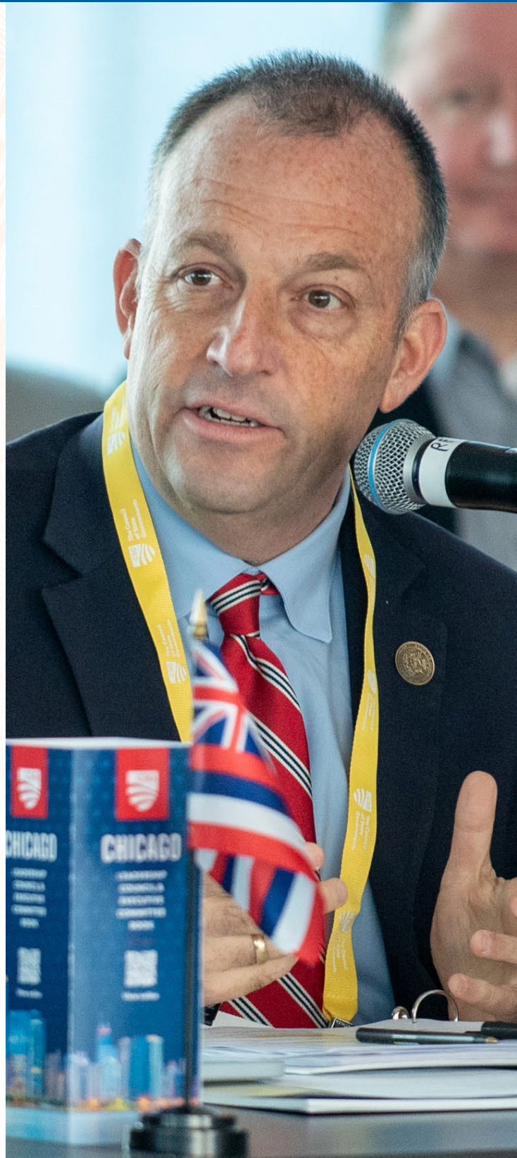
Hawai'i Gov. Josh Green, 2025-26 CSG National President, leads the Leadership Council meeting at the CSG National Conference.

Exhibit your support and increase your brand exposure at one of the CSG National Conference all-attendee receptions. Lead sponsorships offer the chance to help craft your theme into the evening and Reception Bar Sponsors will have on-site branding at bar locations during one reception of choice. Reach out to the CSG Development team to discuss opportunities to host your own reception.