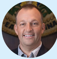
NATIONAL PRESIDENT Josh Green Governor Hawai'i