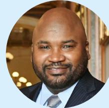
IMMEDIATE PAST NATIONAL CHAIR Elgie Sims Senator Illinois