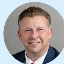
CSG WEST CHAIR Todd Weiler Senator Utah