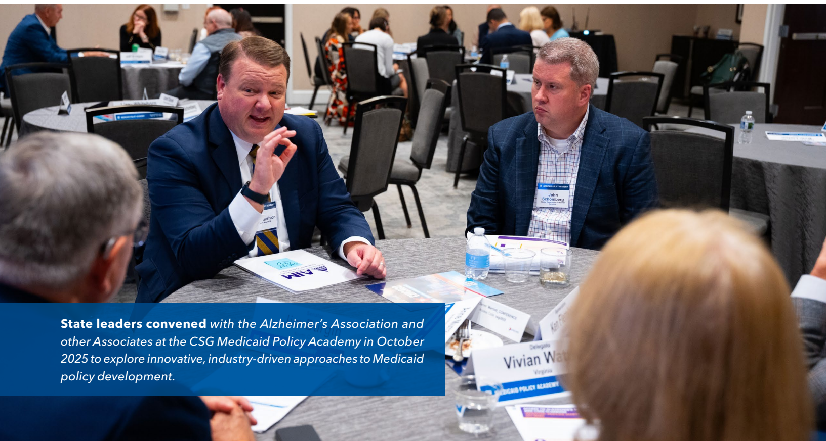
State leaders convened with the Alzheimer’s Association and other Associates at the CSG Medicaid Policy Academy in October 2025 to explore innovative, industry-driven approaches to Medicaid policy development.