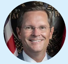
NATIONAL CHAIR-ELECT Cameron Sexton Speaker of the House Tennessee