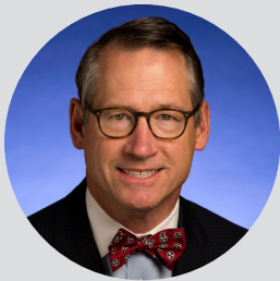
BO WATSON Senator Tennessee