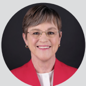
PRESIDENT Governor Laura Kelly Kansas