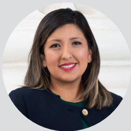
MELISSA HURTADO Senator California