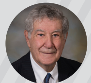
IMMEDIATE PAST CHAIR Sen. Lou D'Allesandro New Hampshire