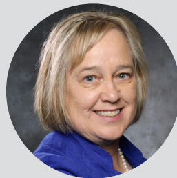
KRISTEN JURAS Lieutenant Governor Montana