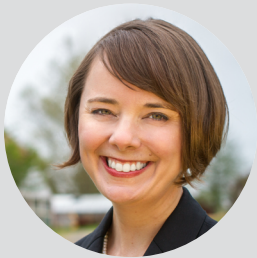
SHENNA BELLOWS Secretary of State Maine