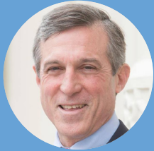
Gov. John Carney Delaware CSG National President