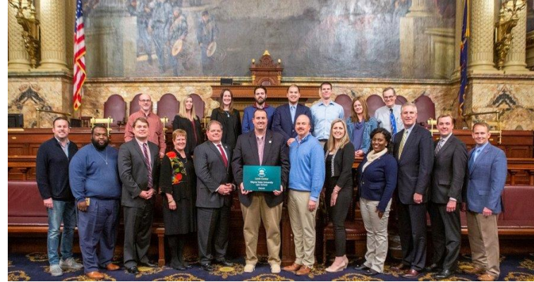
Pennsylvania Oversight Committee