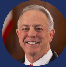
NATIONAL PRESIDENT Gov. Joe Lombardo Nevada