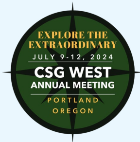
CSG West Annual Meeting July 9-12, 2024 | Portland, Oregon

The CSG regional meetings are events convened each summer by the CSG regional offices — CSG East, CSG Midwest, CSG South and CSG West. Each event is unique to its region and brings together state policymakers of all levels and branches — from those just finishing their freshman session to Senate presidents and speakers of the House. Each meeting hosts between 500 and 1,000 attendees, depending on the regional location, and the programs feature strong host state pride, enriching public policy discussions and leadership development trainings.