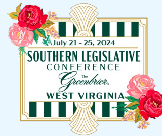
CSG Southern Legislative Conference Annual Meeting July 21-25, 2024 | The Greenbrier, West Virginia