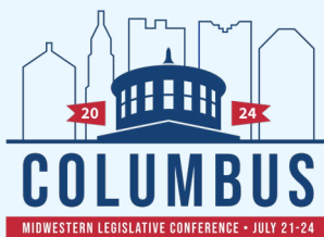
CSG Midwestern Legislative Conference Annual Meeting July 21-24, 2024 | Columbus, Ohio