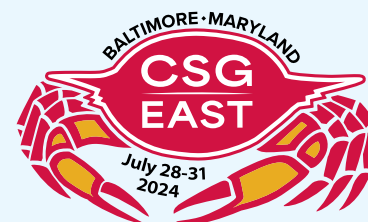
CSG Eastern Regional Conference Annual Meeting July 28-31, 2024 | Baltimore, Maryland